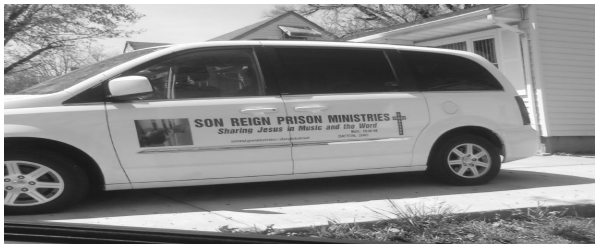
Bringing Hope to the State of Ohio.

All Coming Together is In One Name ACTION !!!!!